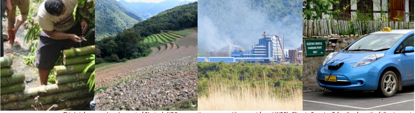
This brief was produced as part of Bhutan's NDC preparation process with support from UNDP's Climate Promise & funding from the following partners: